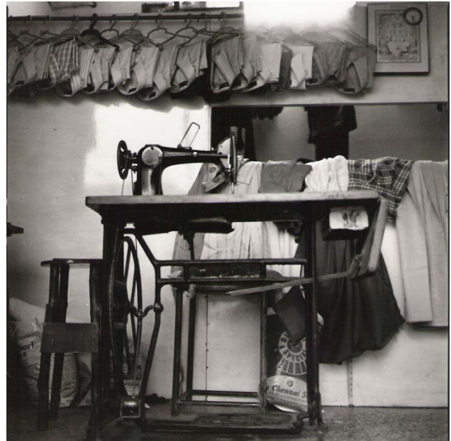
From Factory Diaries, Dayanita Singh.