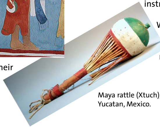
Maya rattle (Xtuch), Yucatan, Mexico.

For the Maya, playing music was a way to call to their gods and ancestors. What does music mean to you?