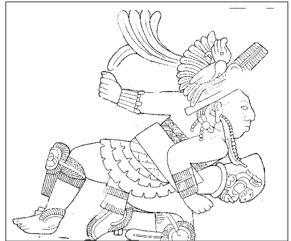
Left: reconstruction of the ball park at Copan, Honduras. Above: Maya drawing of a ball player

The Maya called their ballgame "pitz," a word that means "ball." There is evidence that both men and women were ball players.